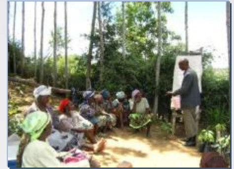
Farmers Workshop- Kenya

Harmonization between Nature Conservation and Human Activities