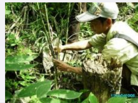
Forest conservation - Laos