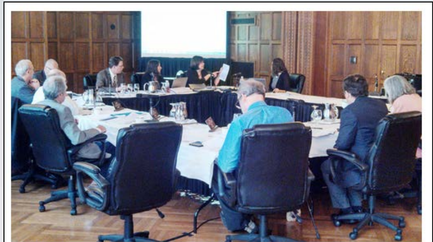
Council members at work with the staff in Spokane April 9