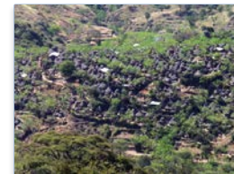
Konso Cultural Landscape