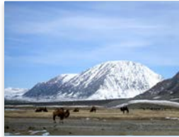
Petroglyphic Complexes of the Mongolian Altai