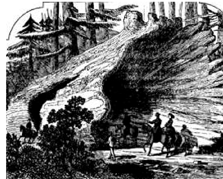
THE STUMP AND TRUNK OF THE MAMMOTH TREE at sequoia

Showing the Gladden Party of Thirty-five Men, Barring out the Log of the Tree