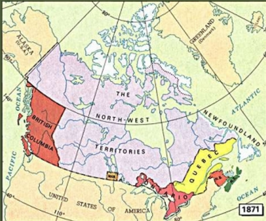
British Columbia joins the Dominion of Canada as the sixth province.