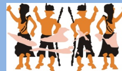
Aliansi Masyarakat Adat Nusantara

Aliansi Masyarakat Adat Nusantara (AMAN)