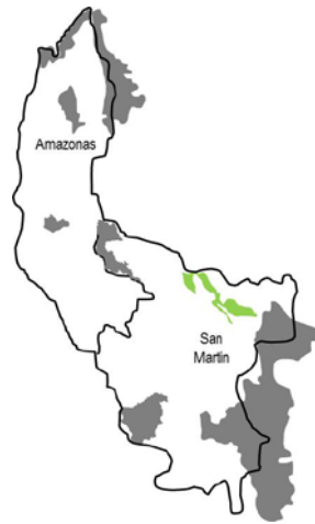
ANP + ACR