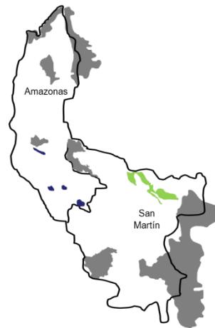
ANP + ACR + ACP