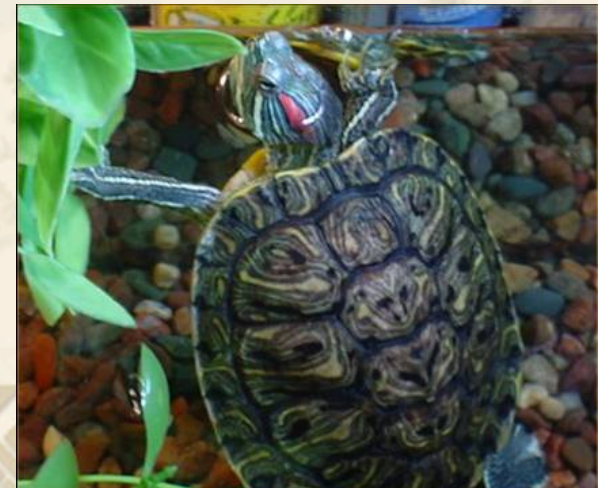
red-slider turtle ( Trachemys scripta )

Accidentally, invasive species golden apple snail ( Pomacea canaliculata ) and red-slider turtle ( Trachemys scripta ) have been released to the Dianchi Basin by Buddhist believers.