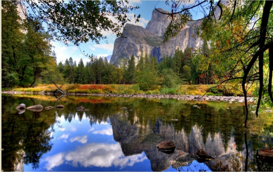
Yosemite National Park

“...activities of conservation organizations now represent the single biggest threat to the integrity of indigenous lands.”