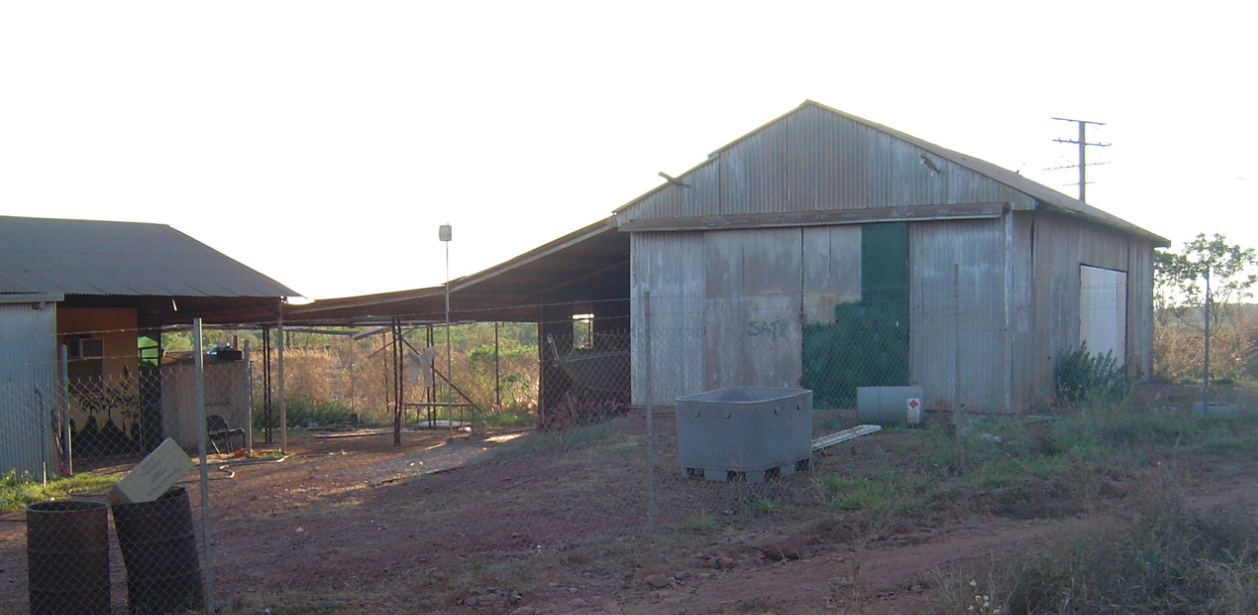
Our work sheds