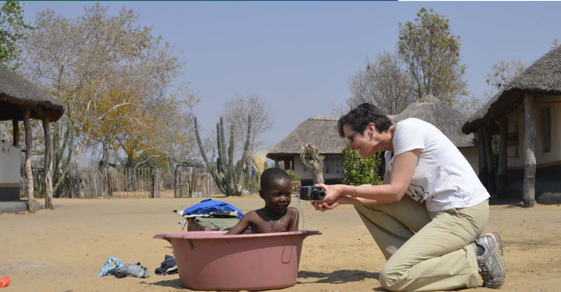
Local village visits